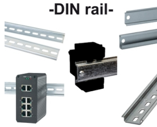
plate for mounting on symmetrical DIN rail