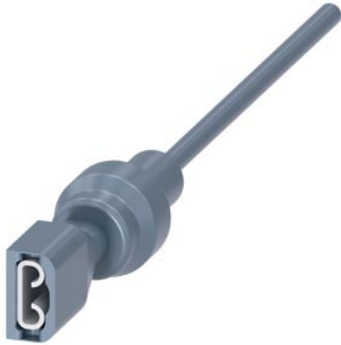
voltage tap accessory for: ETU 8-series