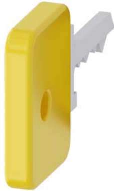
Key for key-operated switch O.M.R., lock number 73033, yellow