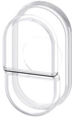
Silicone protection cap for Twin pushbutton, high, clear