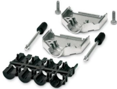
Cable housing for D-SUB-15

Please be informed that the data shown in this PDF document is generated from our online catalog. Please find the complete data in the user documentation. Our general terms of use for downloads are valid.